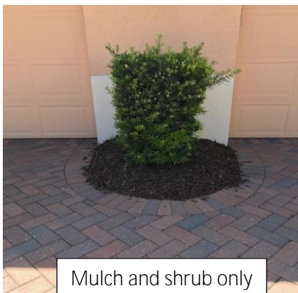
Mulch and shrub only