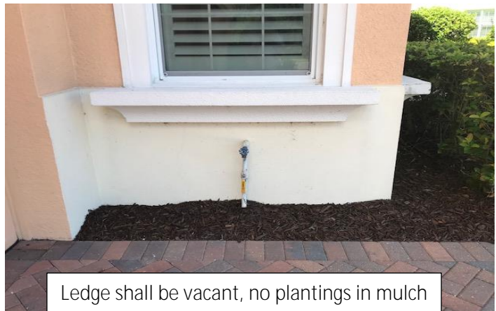
Ledge shall be vacant, no plantings in mulch