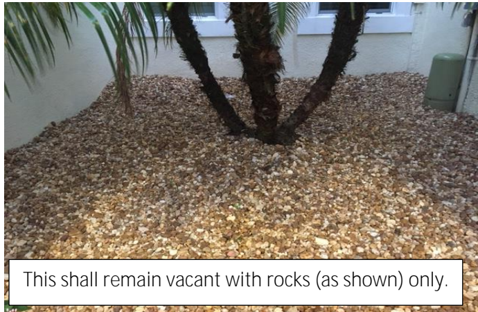
This shall remain vacant with rocks (as shown) only.