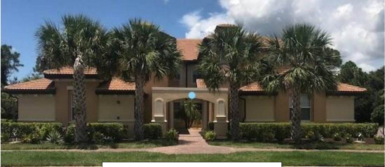
Front of building – plantings shall remain as is

3. Your property shall resemble as below: