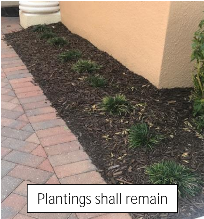
Plantings shall remain